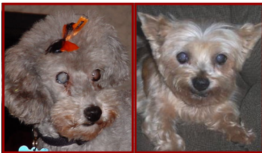
Timmy & Lexus have spent their whole lives together. Timmy is partially blind, but gets around just fine. A loving pair that weighs only 12 lbs total!

NON-PROFIT ORGANIZATION US POSTAGE PAID ORLANDO, FL PERMIT # 4113