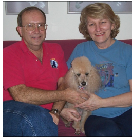
Teddy with parents

Teddy, who is diabetic, has been with us for 2 years. Just like a human, Teddy needs injections of insulin and a controlled diet. Although it took a while to get Teddy on the right track medically, the routine soon became part of everyone's life. Teddy's medications are expensive, but, as a foster, they are paid for by the donations given to CPR. Teddy's "Mom and Dad" say he is one of the best dogs they've ever had. He makes them laugh and they believe he truly appreciates all they do for him.