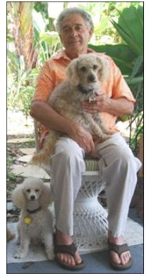
Boomer on Dad's Lap

Boomer is a young terri-poo; handsome, affectionate and strong. His foster parents say he's 90% angel, 10% well, you know! Although improving with plenty of exercise and leadership, his behavior presents too many challenges to adopt him out. Loving and easy-going in the house, but in the big world outside he has a strong chase instinct and sporadic aggression towards other dogs. This behavior is risky to an adoptive family so Boomer will forever be cared for by his foster family who loves him no matter his faults.